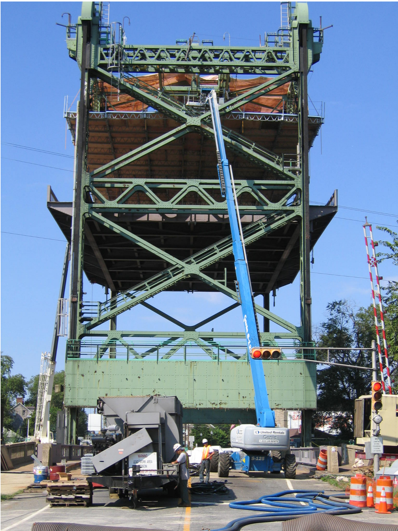
Rte 44 Lift Span Bridge Over Mantua Creek Quik Deck Platform Looking Up From Below Bridge/Road Deck In Raised Position