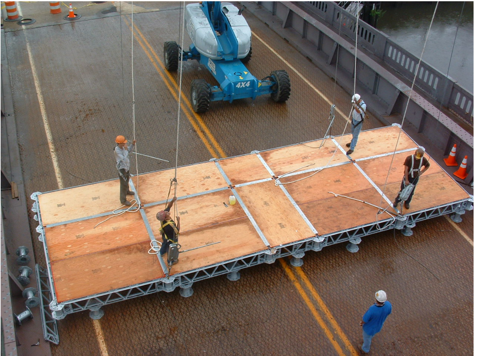
Rte 44 Lift Span Bridge Over Mantua Creek Partial Quik Deck Platform Being Lifted Into Place Upper Level