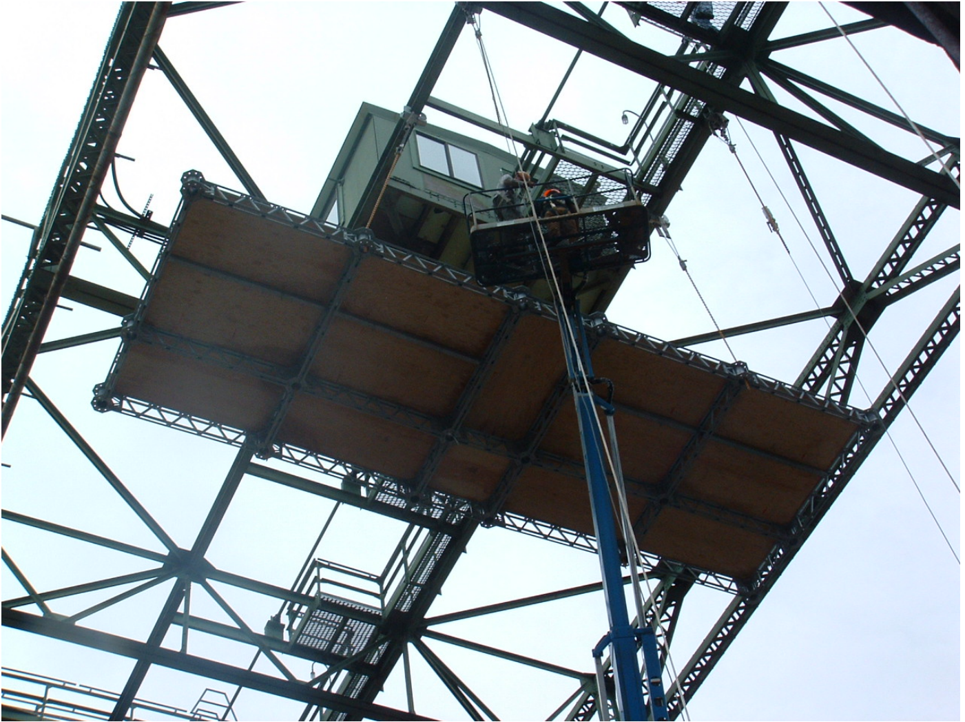
Rte 44 Lift Span Bridge Over Mantua Creek Partial Quik Deck Platform In Place Upper Level