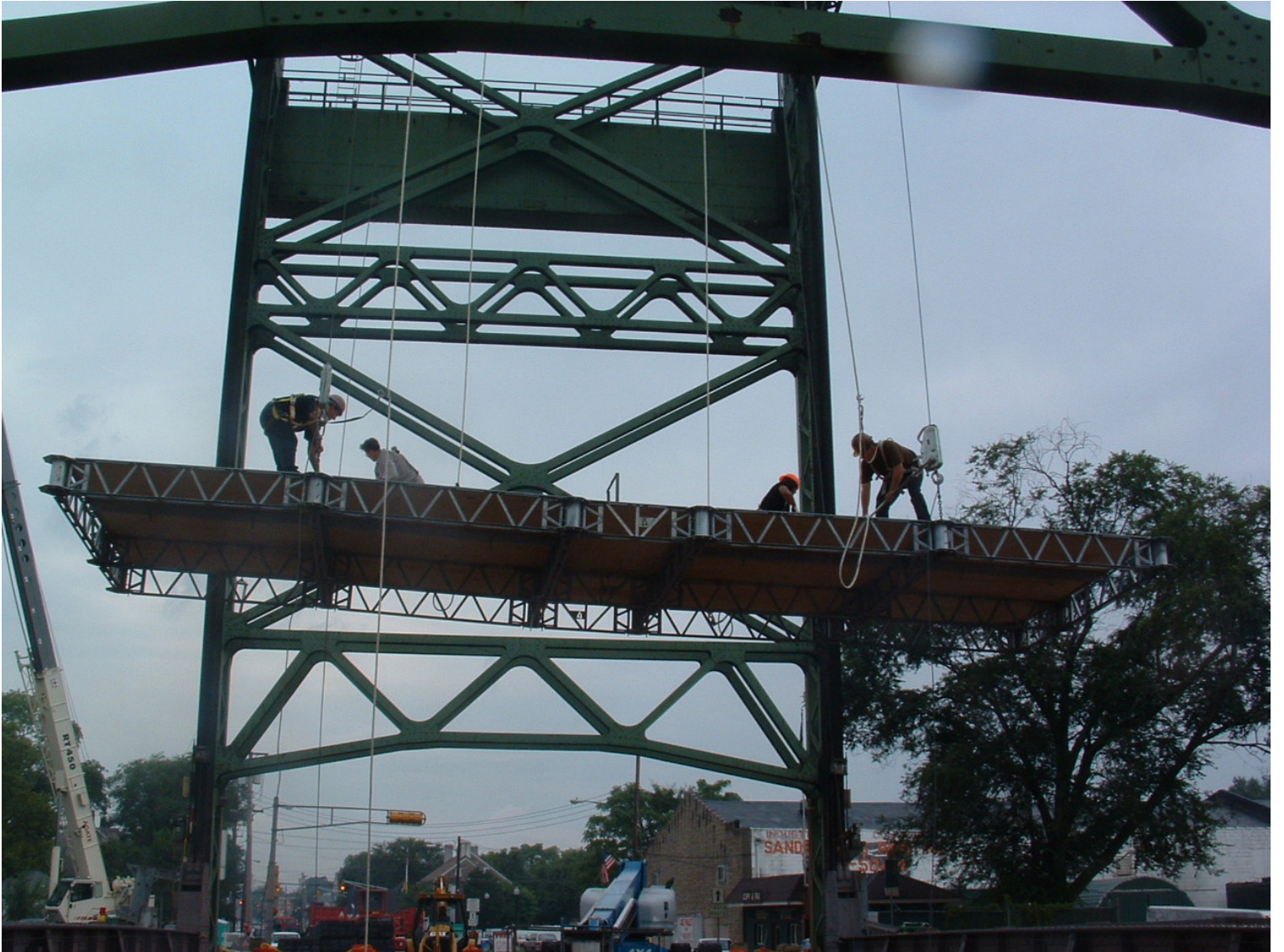
Rte 44 Lift Span Bridge Over Mantua Creek Partial Quik Deck Platform Being Lifted Into Place Upper Level