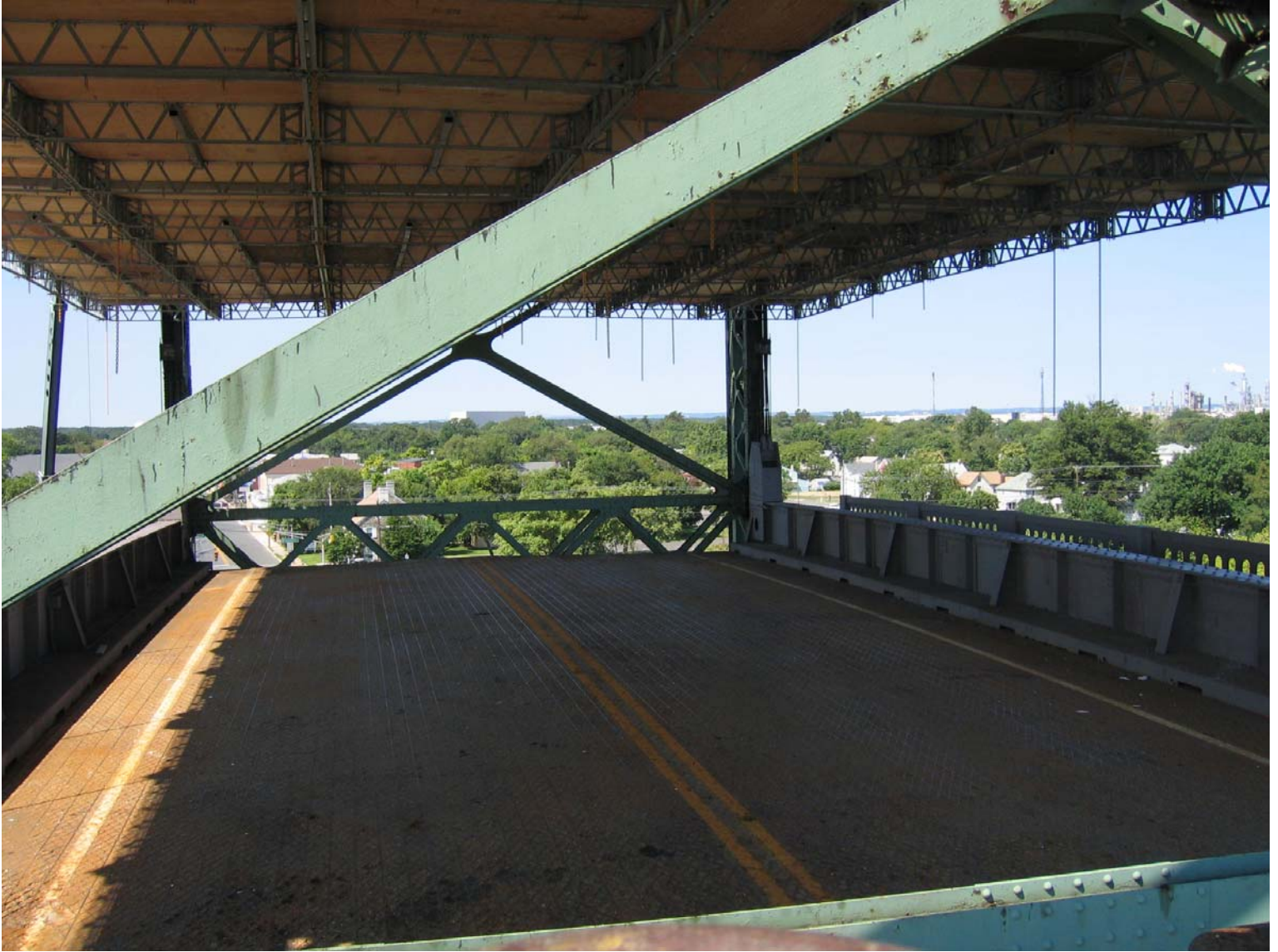
Rte 44 Lift Span Bridge Over Mantua Creek Quik Deck Platform w/ Bridge/Road Deck In Raised Position