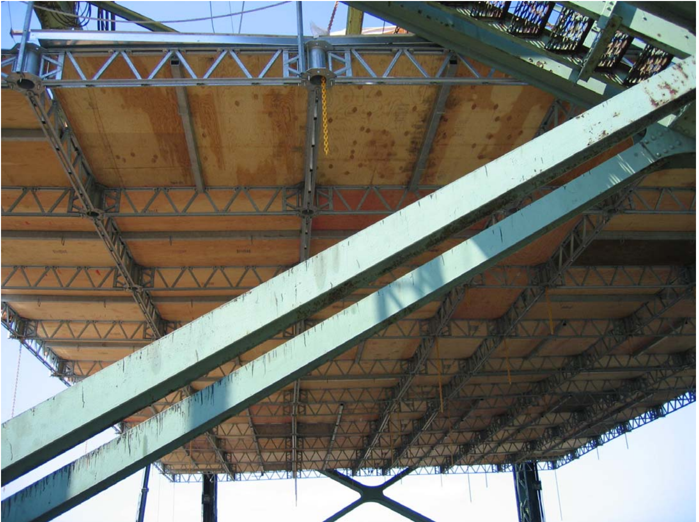
Rte 44 Lift Span Bridge Over Mantua Creek Quik Deck Platform Looking Up From Below