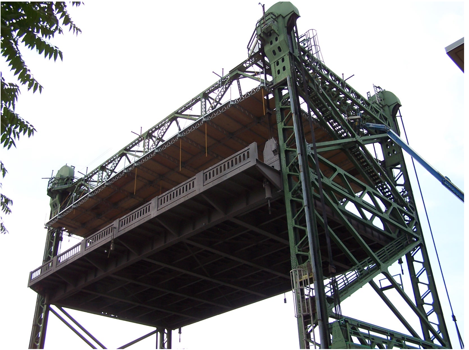
Rte 44 Lift Span Bridge Over Mantua Creek Quik Deck Platform Looking Up From Below Bridge/Road Deck In Raised Position