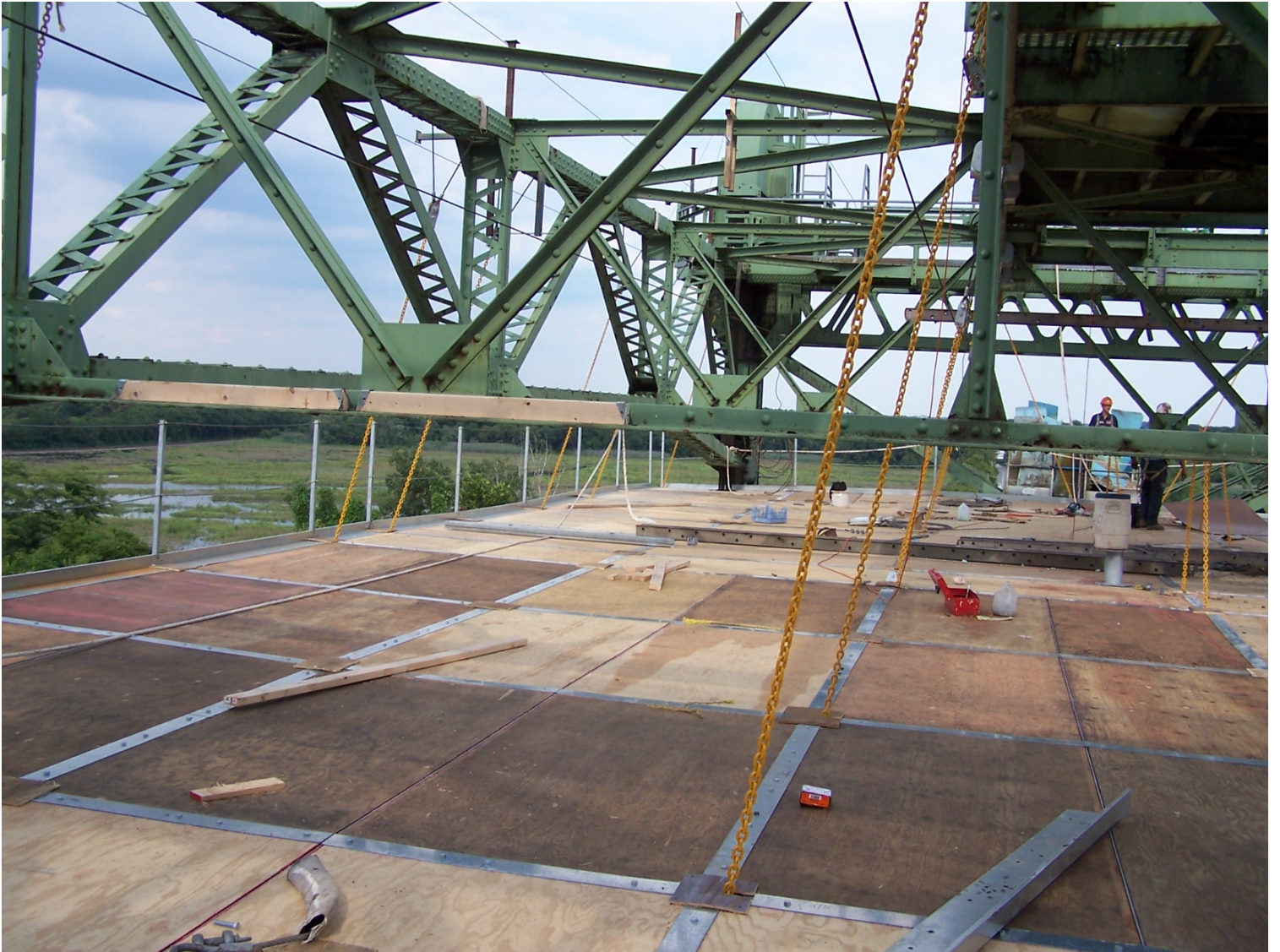
Rte 44 Lift Span Bridge Over Mantua Creek Quik Deck Platform