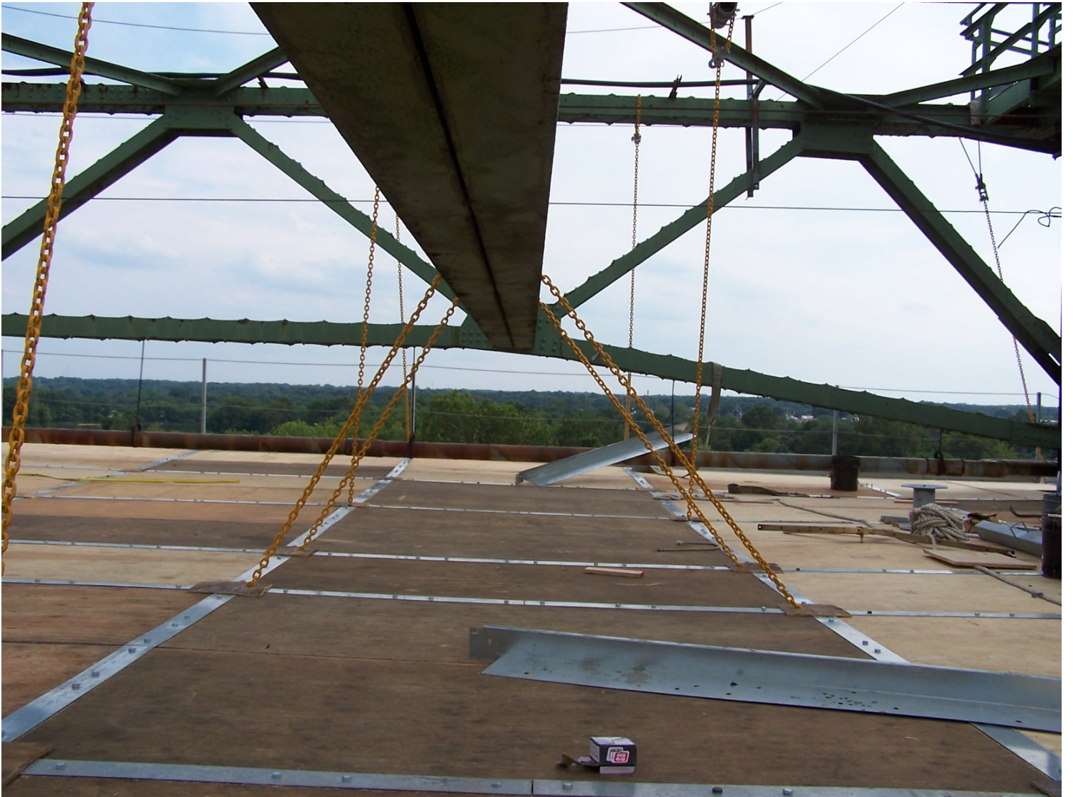
Rte 44 Lift Span Bridge Over Mantua Creek Quik Deck Platform