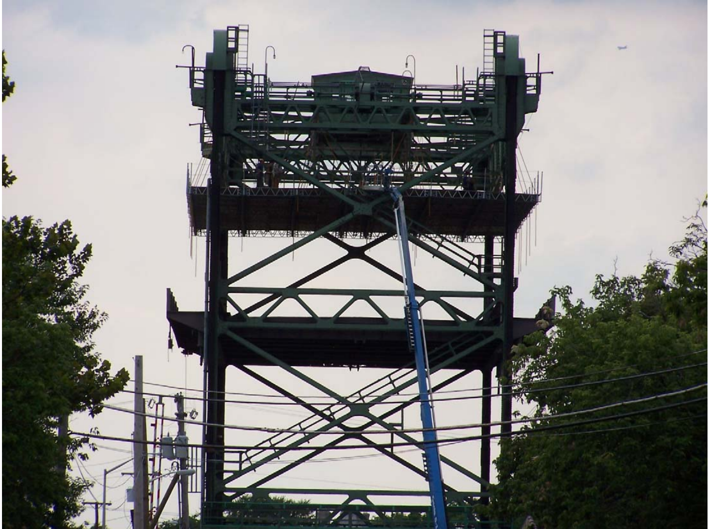
Rte 44 Lift Span Bridge Over Mantua Creek Quik Deck Platform Upper Level

PROJECT DESCRIPTION: Steel Repairs -Cable Supported Metal Deck Platform System